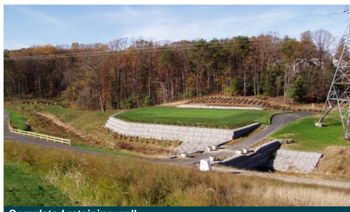
Completed retaining wall

Headquarters—East Coast 10303 Governor Lane Blvd, Williamsport, MD 21795 Tel: 301-223-6910 Fax: 301-223-6134