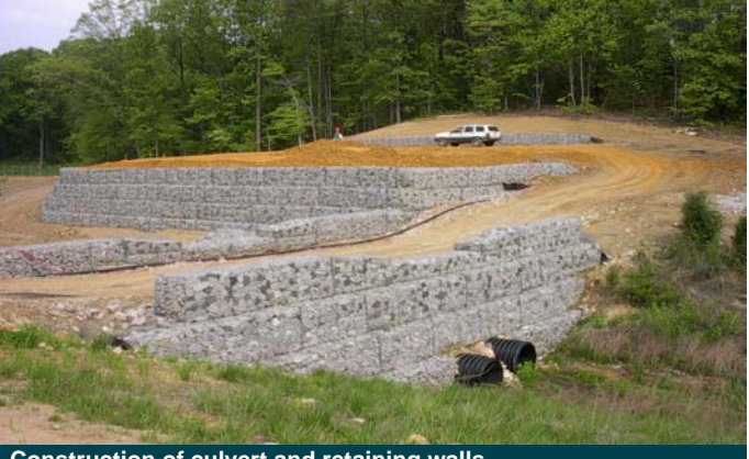
Construction of culvert and retaining walls

The closing and capping of the landfill was completed using a clay cap layer, protected by a geotextile. Top soil and landscaping completed the closure. Water run-off from the landfill would be collected by perimeter ditches. Due to the gradient of some of the ditches some erosion protection was required. A series of retention ponds were also included in the design which also would provide visual interest to the golfers using the course.